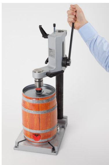
1) See details on page 2

Press-in device for closing HUBER PartyKEGs with the HUBER combi-bungs. The guide stops are fixed for safe and speedy positioning of the barrel. The appropriate pressure is applied simply & consistently thanks to the spring-loaded locking head made of stainless steel and provides perfect bunging every time.